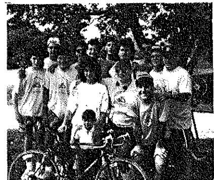
Members and friends of Saline, MI Mission at their 1st annual Bike-A-Thon.