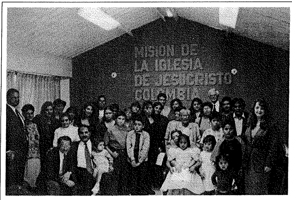
The Church of Jesus Christ in Colombia.