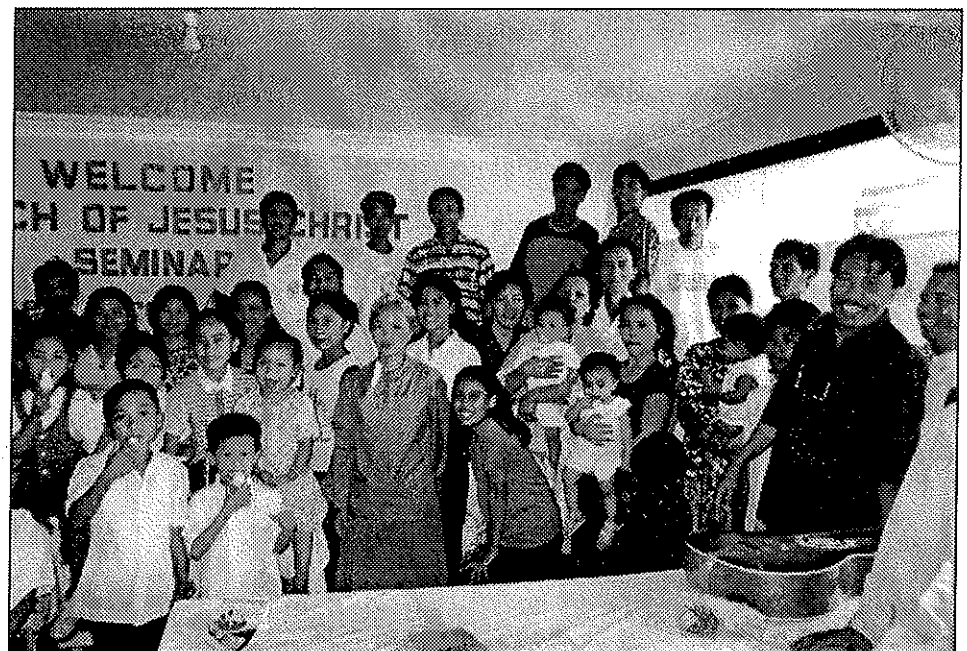
Saints in Bohol Saturday seminar meeting.