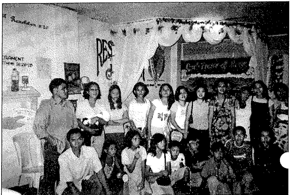
Saints at Davao City